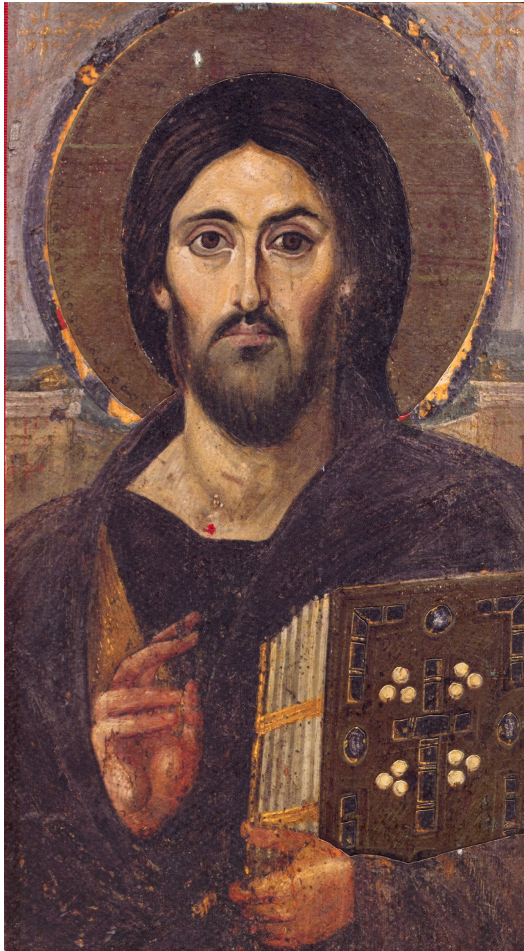
Figure 1. Christ Pantocrator. Encustic painting from St. Catherine's Monastery, Mount Sinai, Egypt, seventh century.