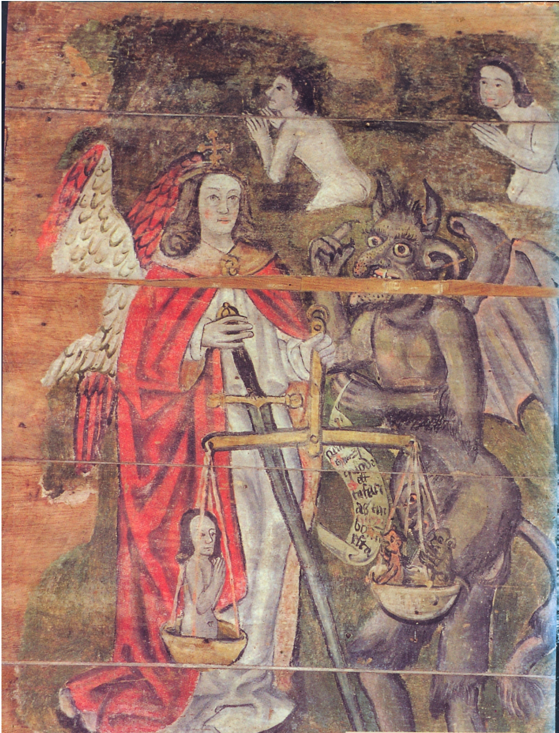
Figure 1.1. A doom shows the final judgement of souls after death; each person comes equally before the throne of God, and is selected to go to Heaven or to Hell. Wenhaston, Suffolk